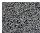
Natural Gray Blend